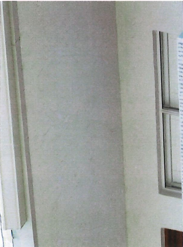
Structural: Reinforced Concrete