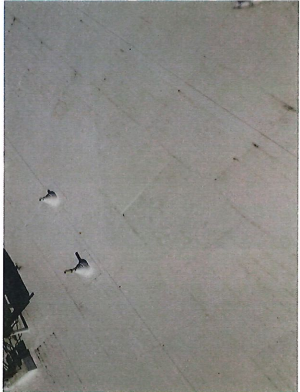
Membrane Roof Covering